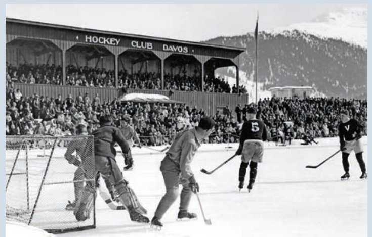
Action scene from a 1927 game between HC Davos and the Montreal Victorias, marking the first time an explicitly Canadian team played in Davos