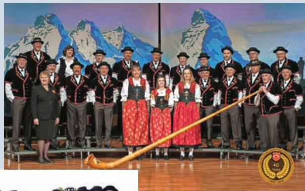
2016 (40th Anniversary)