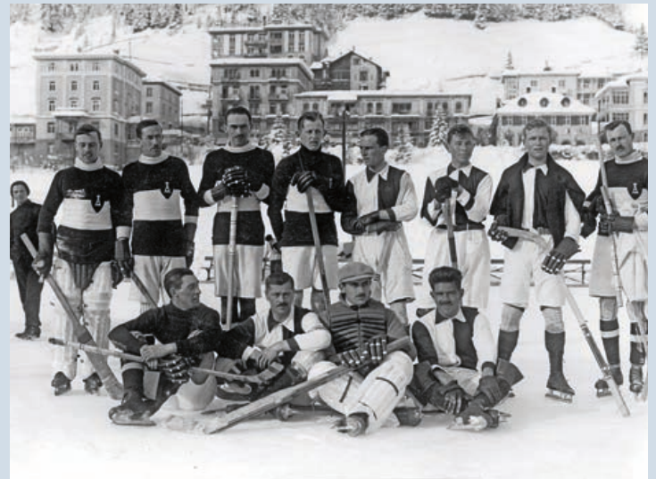
The British Army team in 1923. HC Davos played against a British Army team, in which Canadian players were likely involved