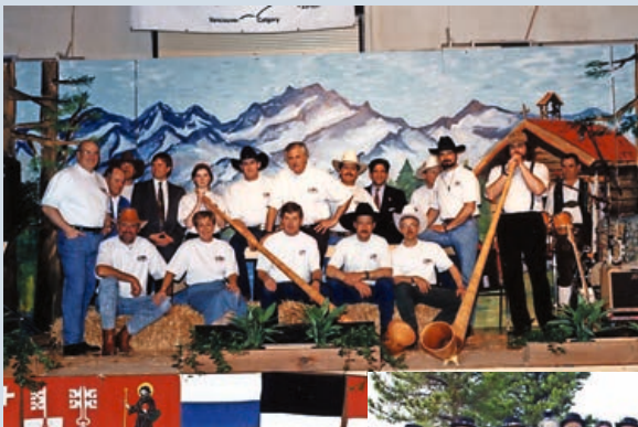
2006 (30th Anniversary)