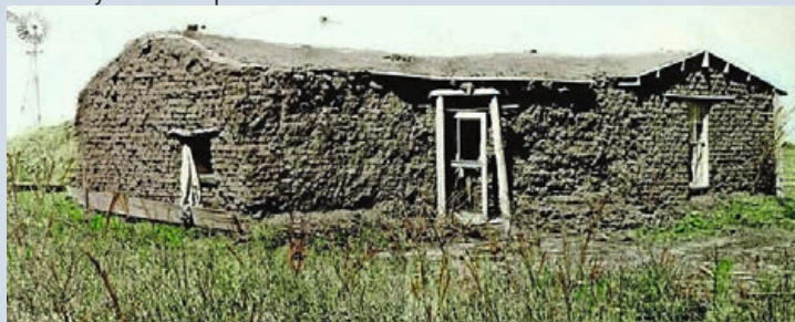
The original single-storey Kobi homestead in the Endiang region. This archival reference serves as the historical foundation for our current research and location scouting