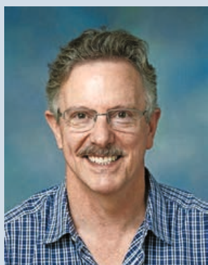
Pro Ticino Prize