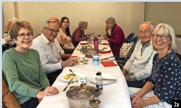
Gschwellti and Chäs afternoon.