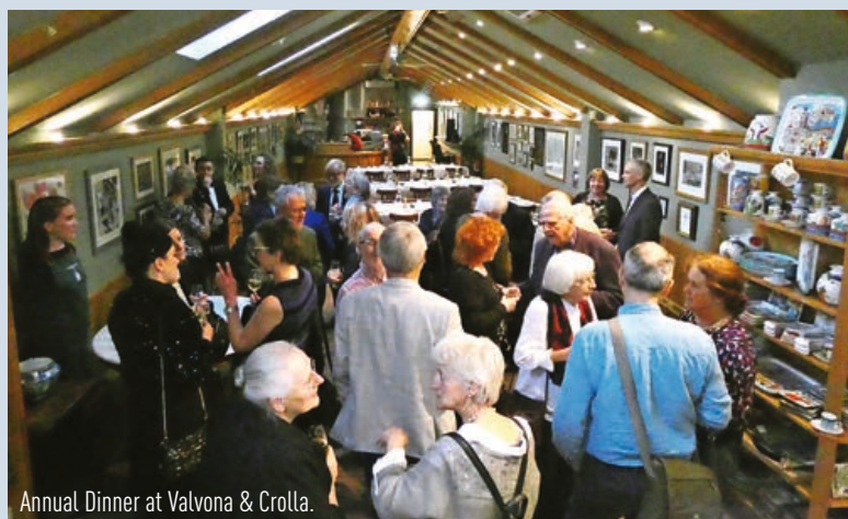
Annual Dinner at Valvona & Crolla.