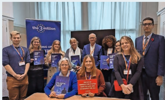
Roundtable at Parliament House hosted by Pete Wishart MP and the3million.

The key takeaway from this session was clear, we must inform the MPs about these ongoing problems. Many are still unaware of the scale of digital system failures and the fear they cause among migrants and foreign nationals. The more people reach out to their representatives, the stronger the case will be for a Parliamentary review and reform of the system. I therefore urge our Swiss Abroad in the UK to contact their MP and express their concerns and fears.