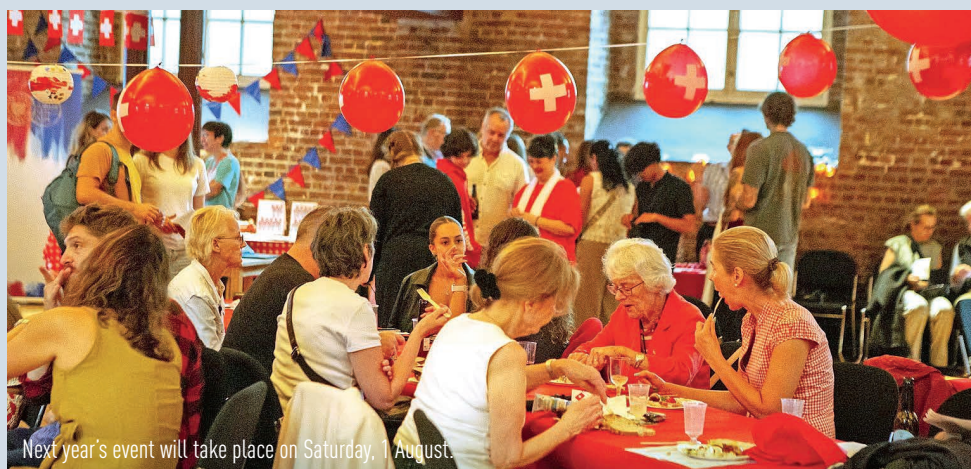
Next year's event will take place on Saturday, 1 August.

snd.hello@outlook.com or directly on the homepage to stay connected with news, programme details, and raffle prize announcements.