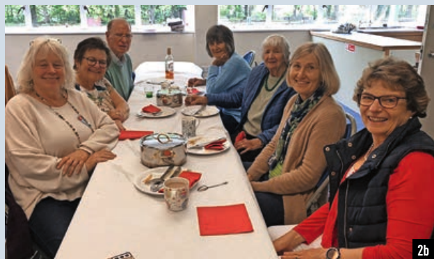
Members enjoyed a relaxed and friendly atmosphere.