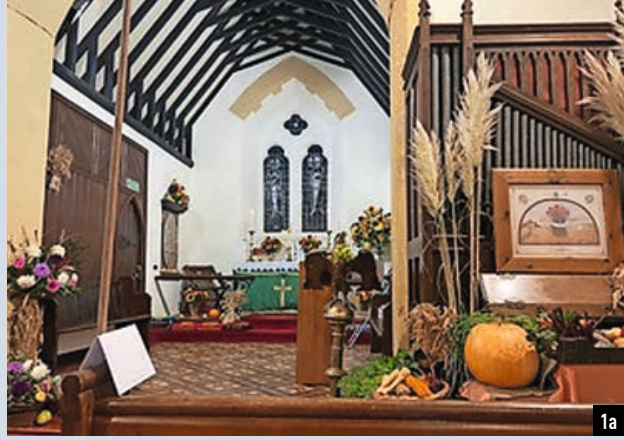
The Harvest Festival Service at St Peter's Church.

For further information about upcoming activities, please contact: beat.neukomm@hotmail.com .