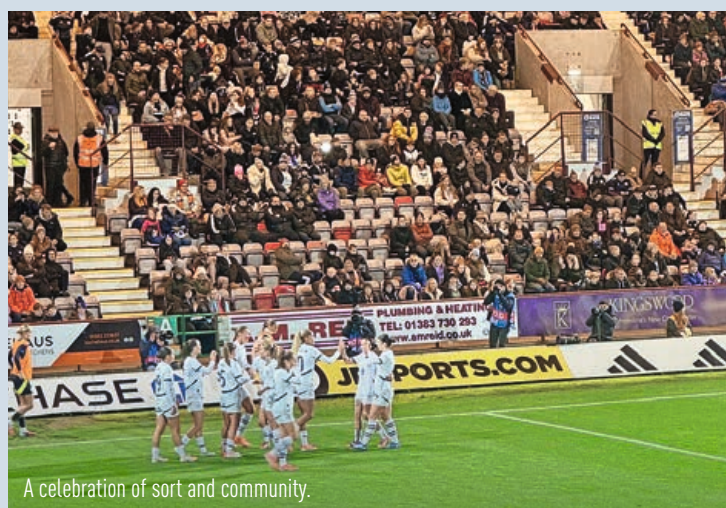
A celebration of sport and community.