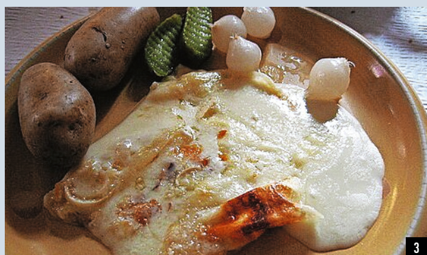
A warm and festive afternoon.