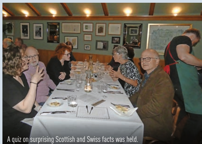
A quiz on surprising Scottish and Swiss facts was held.