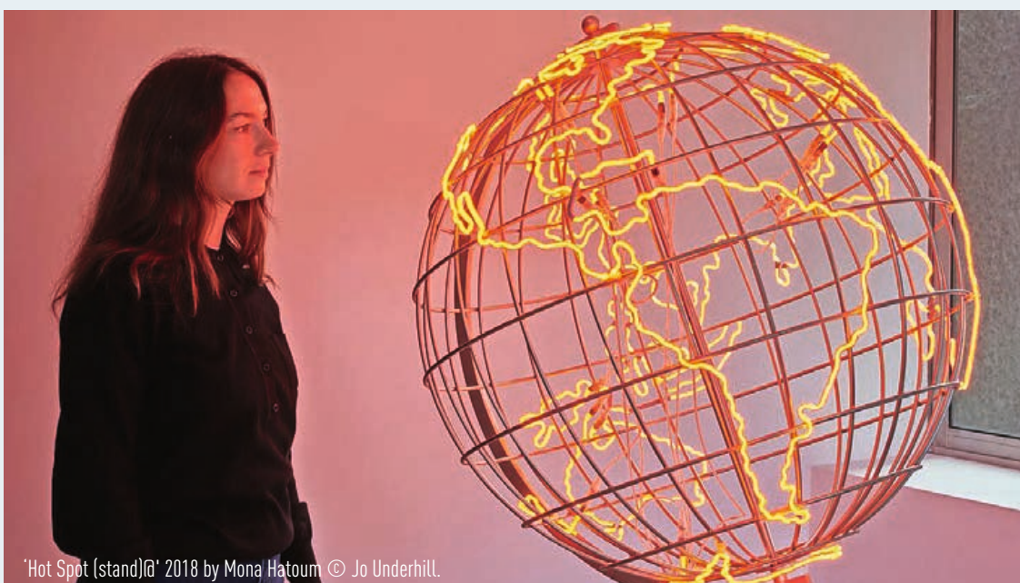
'Hot Spot (stand)' 2018 by Mona Hatoum © Jo Underhill.

barbican.org.uk/whats-on/2025/series/encounters-giacometti