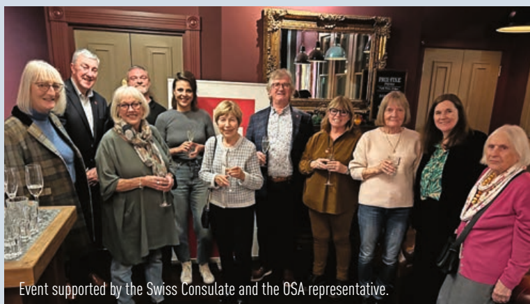
Event supported by the Swiss Consulate and the OSA representative.