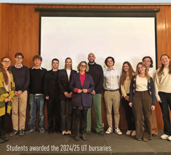
Students awarded the 2024/25 UT bursaries.