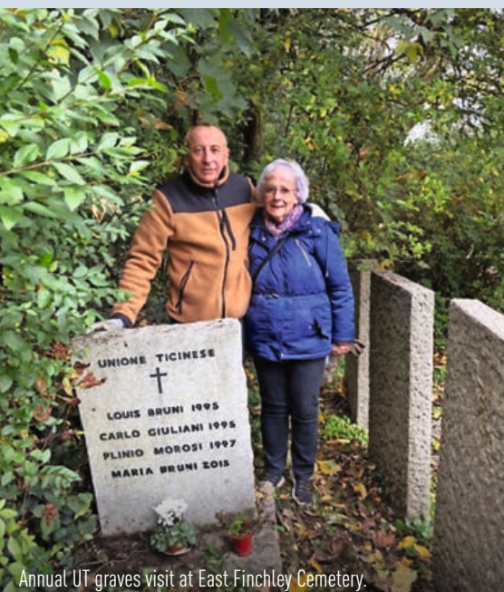
Annual UT graves visit at East Finchley Cemetery.