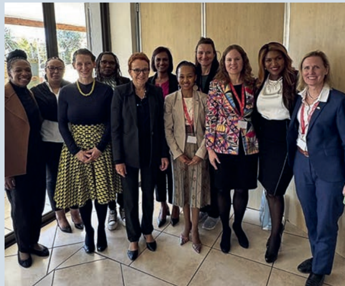
The President of the Council of States of Switzerland, Eva Herzog, and her parliamentary delegation participating in the Women CEOs Roundtable of Swiss companies during their visit to South Africa, focused on Corporate Social Responsibility (CSR).