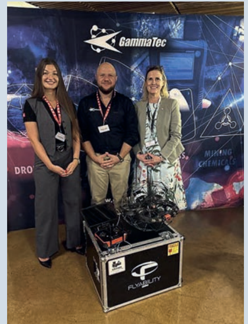
Sustainable mining event featuring the presentation of Flyability's drone technology.

We are proud to serve as a bridge between Switzerland and Africa and look forward to continuing this journey of collaboration and development in 2025.