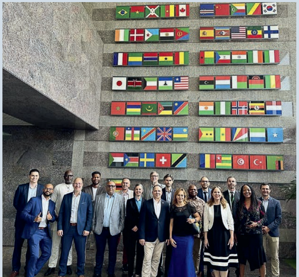
Switzerland's Infrastructure Delegation at the African Development Bank in Abidjan, Côte d'Ivoire.

We are also the coordinating arm of Team Switzerland (Swiss Export Credit Agency, SERV, industry associations, etc.) in sub-Saharan Africa. In this capacity, we support the large infrastructure mandate of the Swiss Confederation, facilitating infrastructure projects across the region by leveraging Swiss expertise and capabilities.