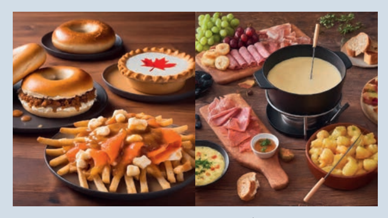
Draw what comes to mind when hearing "Typical Canadian / Swiss foods"