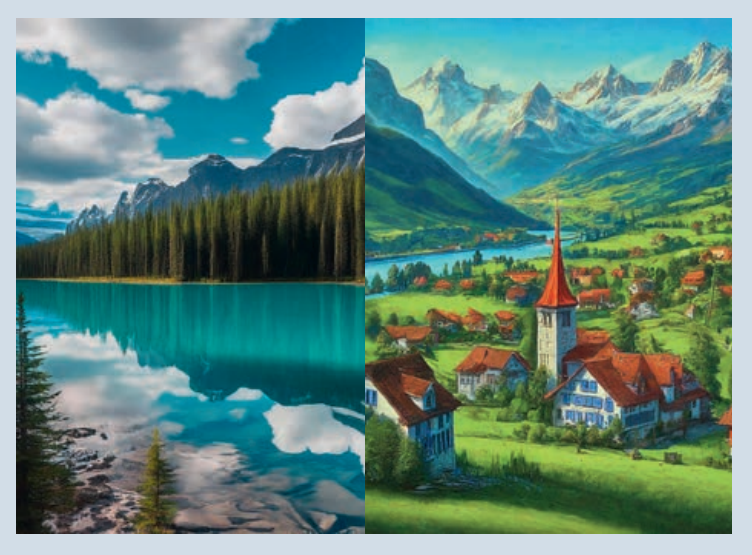
Draw what comes to mind when hearing "Typical scene from Canada / Switzerland"

■ If you would like to experiment with Gemini, you can access the bot from https://gemini.google.com.