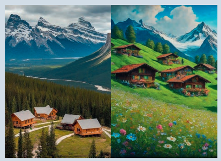
Draw what comes to mind when hearing "Edelweiss Village in Canada / Switzerland"