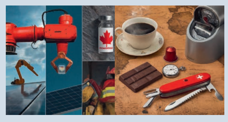
Draw what comes to mind when hearing "Canadian / Swiss inventions"