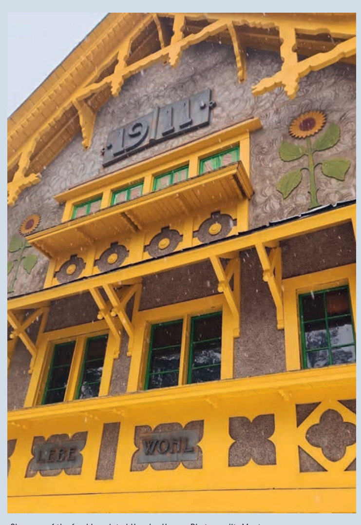
Close-up of the freshly painted Haesler House.

Last but not least, both parties are actively collaborating on the vision of creating a Swiss Guides Great Hall that would pay homage to the mountain guides that called Edelweiss their home, bringing their history to life and celebrating their contributions.