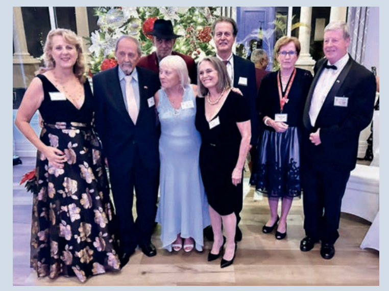
From left to right:

Soon the gourmet buffet was opened and all enjoyed a very tasty dinner. During the dessert round the anticipated raffle draw was getting started. We had some very exciting prizes thanks to the wonderful sponsors supporting our club. One lucky winner took home several items. Some of the top prizes were two economy roundtrip tickets with Swiss from the US to Zürich; a one-week train ticket in 1st Class for two for unlimited travel in Switzerland from Swiss Tourism; and a 3-day-wellness vacation package from the