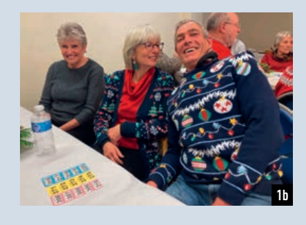
SASC Christmas party.