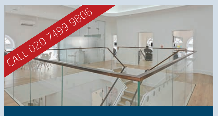
NEW PATIENTS WELCOME