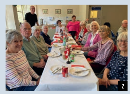
North Wales Swiss meetup.