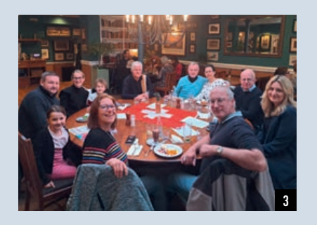
Festive 'Treff' in Liverpool.