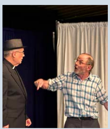
Two scenes from the 2023 play "In Himmel wänd alli"