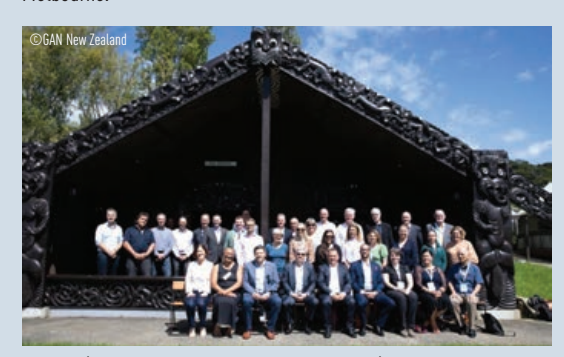
Powhiri (Indigenous Maori welcome ceremony) for the 'Future of apprenticeships' delegates on Waiheke Island near Auckland.

labour market. The combination of highly skilled professionals with academically trained specialists is key to drive innovation outputs and thus to lift the global competitiveness of the exportoriented Swiss economy. The professional associations (trade and branch associations) and the individual companies are responsible for defining and continuously updating the actual training content, thereby ensuring that the skills of the workforce meet the needs of the labour market. The companies offer apprenticeship positions and cover the practical part of the training. The social partners (employers association and trade unions) also have a role in the management of the system. VET enjoys high social status and is therefore perceived as being an equally valuable alternative to the academic path. In fact, former apprentices have risen to lead