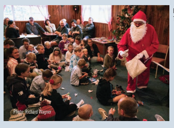
Busy Santa visiting the Taranaki children...

Our Family Christmas Party was held on 4 December at the Newstead School. We were very lucky with the weather as it was a perfect Waikato summer day with blue sky. It was one of the few nice days since end of October. People arrived gradually and a few of the younger children sat down to do some Christmas crafts and decorate gingerbread men, Christmas trees and stars. This is always a lovely activity for the little ones. This year we had only about a dozen children under 10 and a few teenagers but we definitely had a good turnout of adults - young and not so young. Around midday everyone enjoyed the grilled bratwurst and cervelats and a cold drink. After lunch