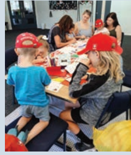
...and on to Hamilton to hand out more goodies.