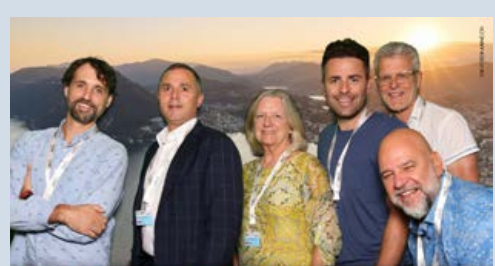
Insieme a Lugano 98° Congresso degli Svizzeri all'estero 2022

Read more about OSA Canada at <a href="https://www.osa-canada.org/about">https://www.osa-canada.org/about</a>.