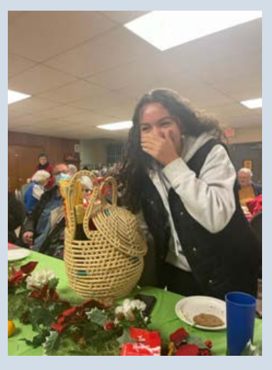
A happy raffle winner