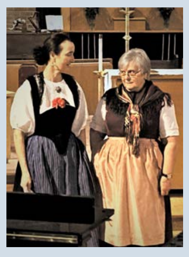
The Valley Girls yodel duet