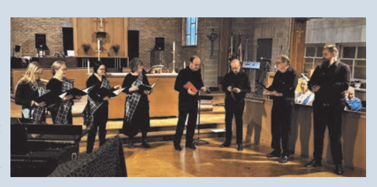
The Vancouver Gaelic Choir in action