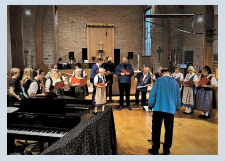
A joint performance by the Vancouver Swiss Choir and the Vancouver Gaelic Choir