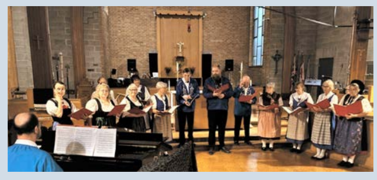
The Vancouver Swiss Choir performing at Burnaby's All Saints Anglican Church