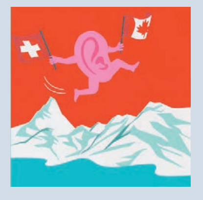
ILLUSTRATION BY ANNA SOMMER © SWISS REPRESENTATIONS IN

Each new segment is launched on the website dedicated to the podcast and through the Facebook pages of each Swiss representation in Canada. The content is available on iTunes, Spotify, and YouTube. Tune in ... there is content for everyone!