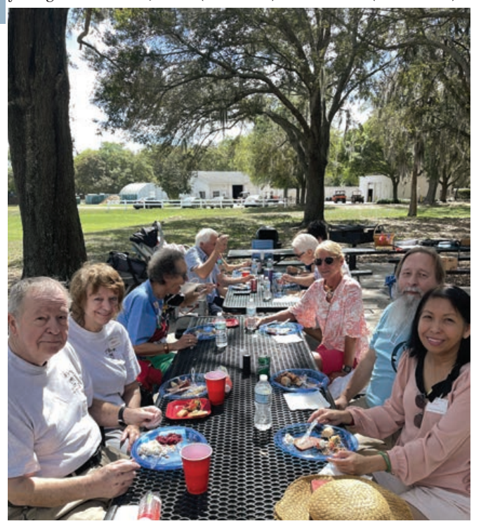
Enjoying a potluck luncheon in the shade of Cypress trees. Another beautiful Florida day!

A beautiful spring day was the backdrop for our Annual Meeting which was preceded by a delicious potluck luncheon. About 25 members enjoyed several typical Swiss dishes under the canopy of Cypress trees while catching up with old friends and meeting our youngest members, Elina (5 months) and Aurelia (25 months).