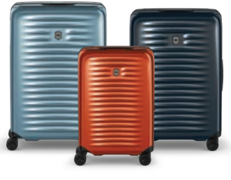
FROM THE MAKERS OF THE ORIGINAL SWISS ARMY KNIFE™ ESTABLISHED 1884

Where innovation and durability fuse. From our lightest hard-shell specification to a super robust outer material, this compact game-changer has it all covered.