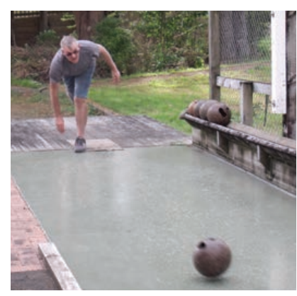
...and Kegeln in Taranaki