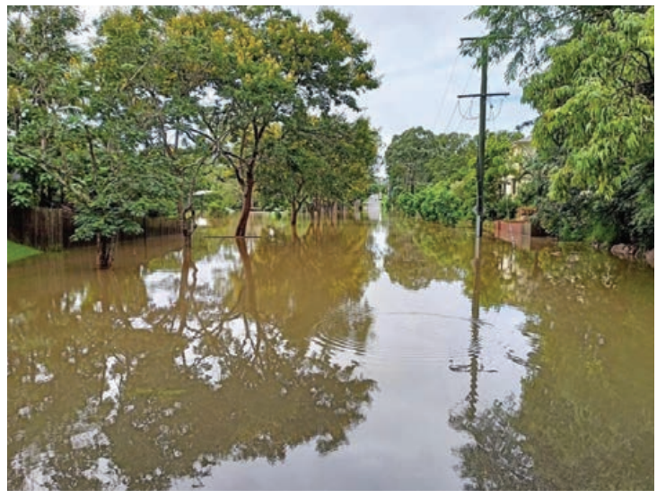
...was transformed into a river within two hours!