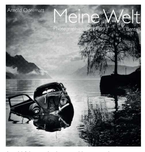
Arnold Odermatt's photographic masterpieces

Obituaries of Swiss citizens living in the UK recently passed away can be published in the September issue of the Swiss Review. Please send an email to: editor@swissreview.co.uk