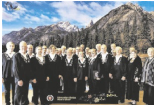
The Edmonton Swiss Men's Choir. Winter 2019 / 2020