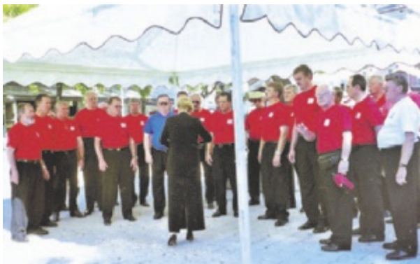
The Edmonton Swiss Men's Choir in Lugano. June 24, 2001