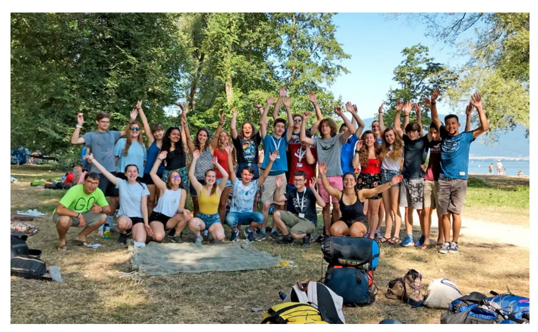
Swiss challenge, Yvonand, 2019.