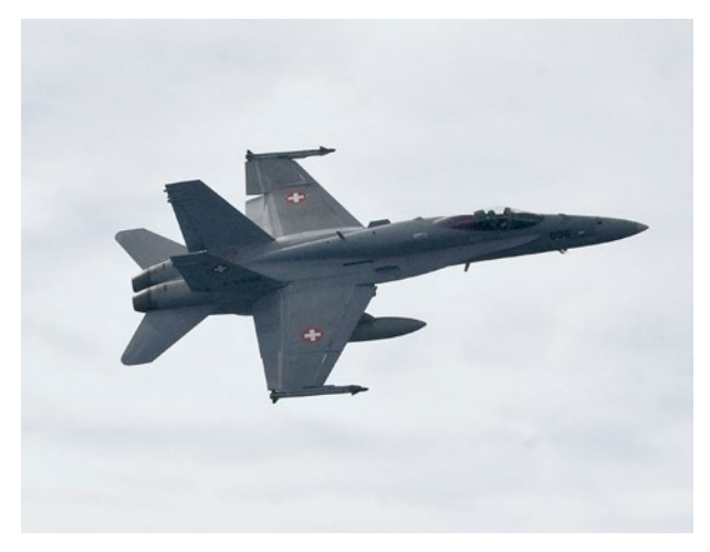
The vote on replacing Switzerland's current fleet of fighter jets was a real cliffhanger.

A wafer-thin majority (50.1 per cent) in favour of the purchase of new fighter jets for the Swiss armed forces caused more than a few raised eyebrows, a mere 8,670 votes having made the difference. Commentators wondered whether this tight result might have gone the other way had all the Swiss Abroad received their voting papers in time. According to a dissection of the vote by the gfs.bern research institute, Switzerland's expatriate population were much less inclined to support the procurement of new fighter jets, with 56 per cent of Swiss Abroad rejecting the proposal.