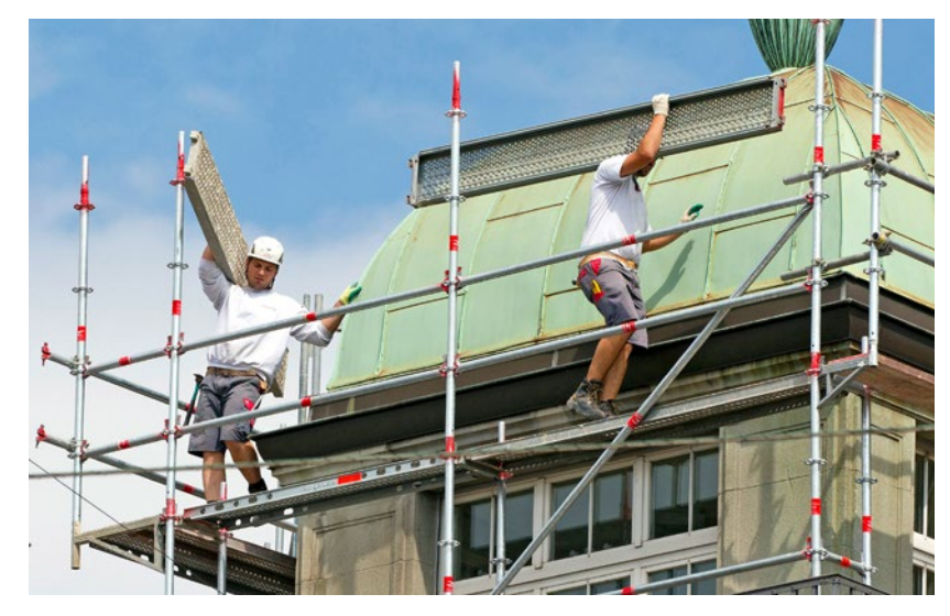
The framework deal's effect on wages and job security remains a contentious issue.

The Federal Council first floated the idea of a bridging pension last year as a domestic policy measure to promote freedom of movement. Many voters over the age of 50 voted for the SVP's "Stop mass immigration" initiative in 2014 because they feared being squeezed out of the job market by an influx of foreign labour. The Federal Council saw the new welfare initiative as a way to allay these fears. Initially, the scheme was more generous in scope and would have benefited around 4,600 people. Parliament subsequently cut the number of potential recipients and introduced a benefits cap. The SVP rejected the bridging measure in principle. Opponents of the new scheme said that it could have the unwanted effect of giving companies an excuse to lay off older employees. However, critics were unable to collect enough signatures for a referendum.