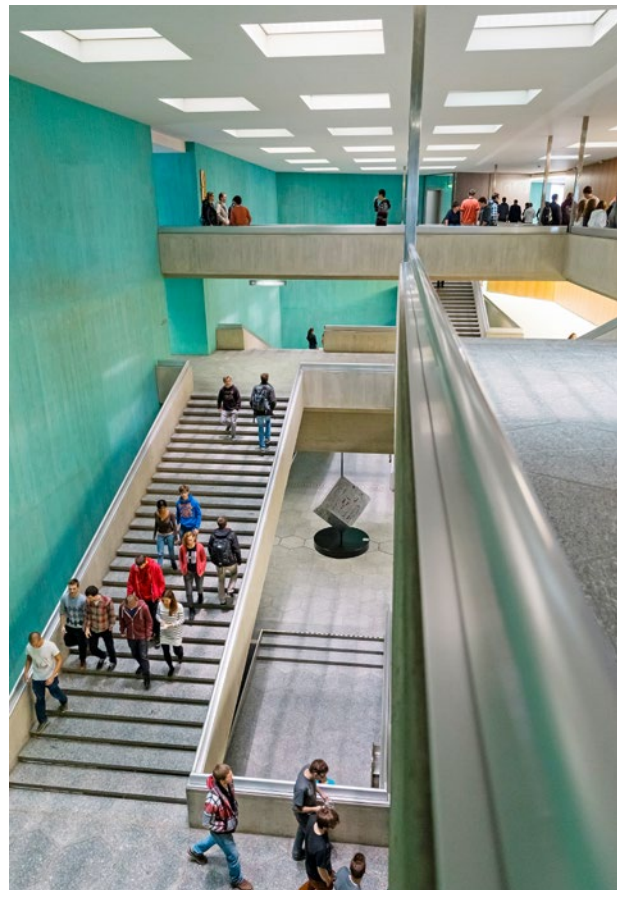
Semester time at the ETH Zurich Hönggerberg campus

With the exception of one private University of Applied Sciences, all of Switzerland's universities are public institutions. The ETH Zurich, the EPF Lausanne and a number of other Swiss universities are well placed in the international rankings (ogy.de/rankings). These rankings are based on various criteria and are mostly geared to a specific target audience (students, researchers, sponsors, prospective students). No rankings can reflect or ultimately compare all the aspects that contribute to a good university. Factors such as geographical location and the local culture also need to be taken into account.