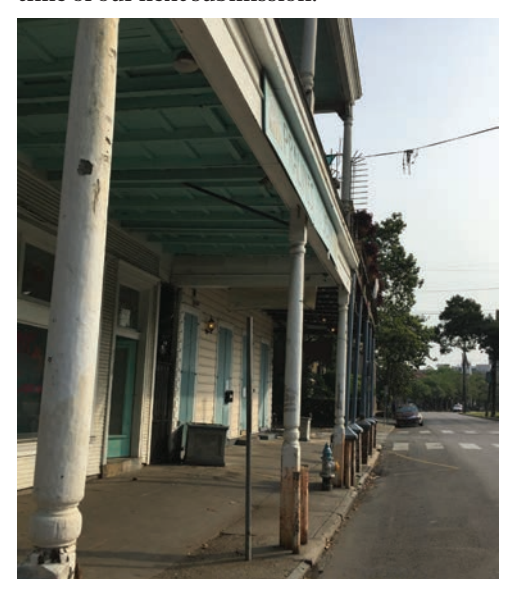
Empty street, St. Charles Avenue, Sunday, April 19, 2020

Stay well, be safe and hopefully things will be looking up by the time of our next submission.