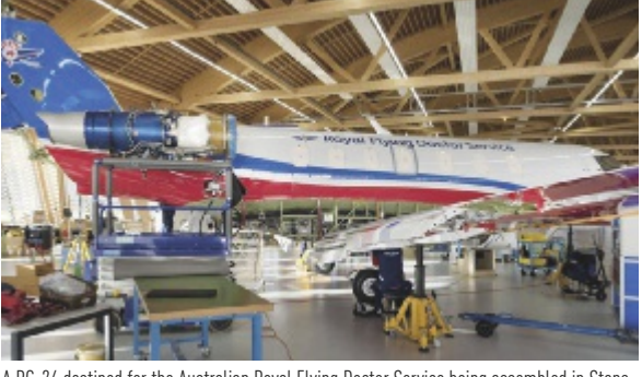
A PC-24 destined for the Australian Royal Flying Doctor Service being assembled in Stans.

At a cost of $26 million, the Australian Royal Flying Doctor Service has acquired two brand new Swiss made Pilatus PC-24 jets to add to its fleet. Pilatus and the RFDS have re-purposed the Pilatus PC-24 jet with state-of-the-art aero medical fit-out that serves as an in-flight emergency ward that can accommodate