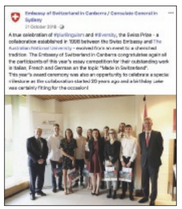
Coverage of the Swiss Prize 2019, a partnership between the Embassy of Switzerland in Australia and the Australian National University.

It is important that your consular representation – the Embassy of Switzerland in Wellington or the Consulate General in Sydney – is notified of any changes of your contact details, in particular your phone and email address, so you can be reached in case of an emergency. You can update your data by sending an email to wellington@eda.admin.ch or sydney@eda.admin.ch respectively (please note these email addresses have changed, please update your records).