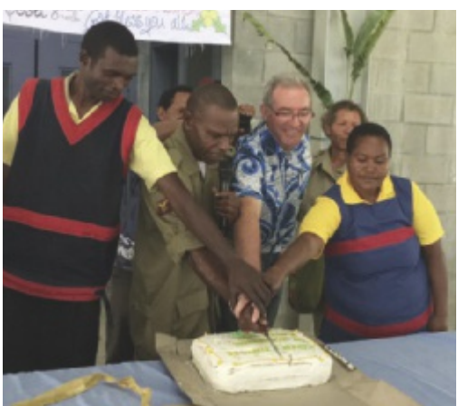
On the occasion of the 20th TEE graduation, the anniversary was celebrated with a 'Hagen Cake' – a popular delicacy in PNG.

On 23 November, 42 inmates at the prison camp Baisu near Mt. Hagen had good reasons to look back and be proud of their investment in their personal life. They finished 15 Bible study lessons based on 'the Book of Acts' with teachings of life core values. The TEE program (Theological Education by Extension) was initiated by our church in 1998 and transformed many lives. 17 former inmates serve in different churches as pastors today.