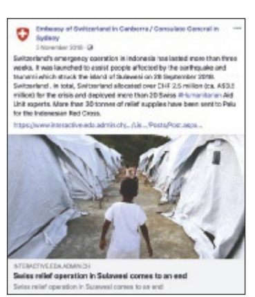
Coverage of Switzerland's emergency operations in Sulawesi, Indonesia.

The Embassy of Switzerland in Australia and the Consulate General in Sydney invite you to join them on Facebook @ SwissEmbassyCanberra and to engage in English, German, French and Italian and share your opinions with its growing online community. Below are two examples of Facebook posts: