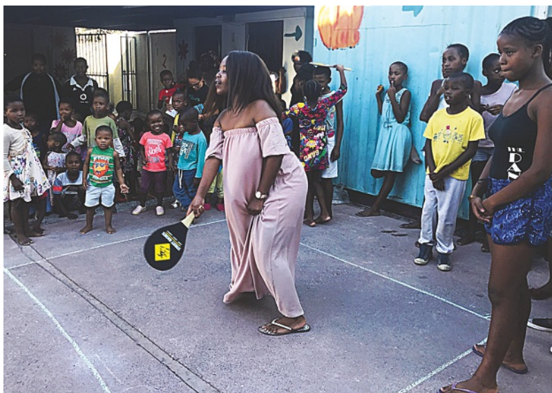
TOP: Street Racket was introduced at a workshop at Pollsmoor Prison in Cape Town.