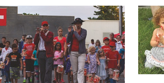
AROVE 3 PHOTOS BY BEN SILLLIVAN