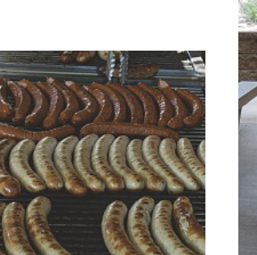
PHOTOS SUBMITTED BY ALEXANDER BELL SWISS SINGING SOCIETY "HARMONIE" WWW.SWISSHARMONIE.COM WWW.SWISSPARK.LA