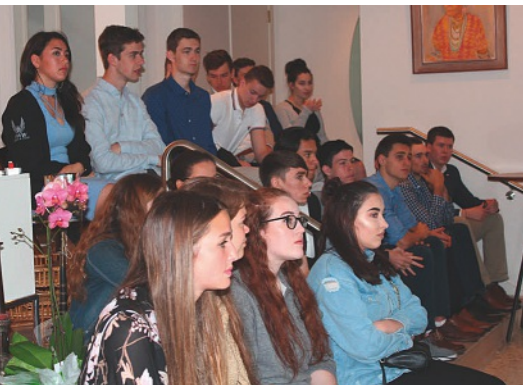
Young adult Swiss at the Consulate General of Switzerland