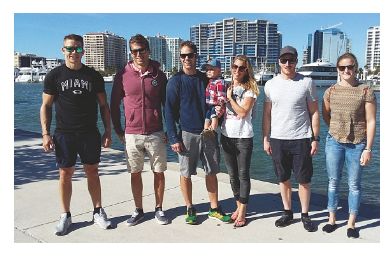
Swiss Canoe Team with Families