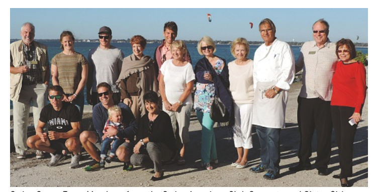
Swiss Canoe Team Members from the Swiss American Club Sarasota and Sister Cities Association Sarasota

We look forward to continuing the deepening of our ties between the two cities!