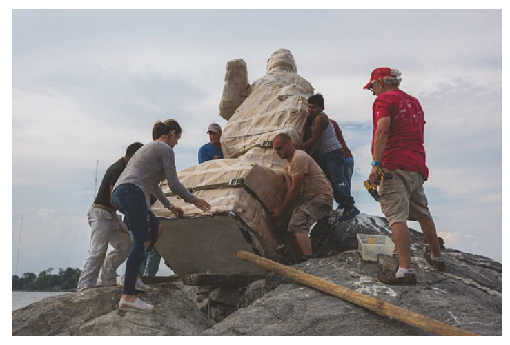
Tell arrived at his final destination

111 Great Neck Road, Great Neck, NY 11021 Phone: (516) 773-6100 • Toll free: (800) 752-1102 Fax: (516) 773-6103 info@overseasbrokers.com • www.overseasbrokers.com