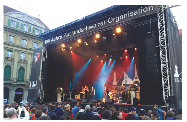
100 years ASO celebration with concerts and activities on the Bundesplatz in Bern

This year, the CSA meeting and OSA congress was particularly interesting. The OSA was celebrating its centenary with a remarkable program. There were concerts on Friday evening and the whole Bundesplatz was dressed in OSA colours. Many information stands and lots of happy people enjoyed what the expat community had on offer. Different groups were presenting themselves and sharing their experience and knowledge. The speech of Bundesrat Didier Burkhalter was also very inspiring.