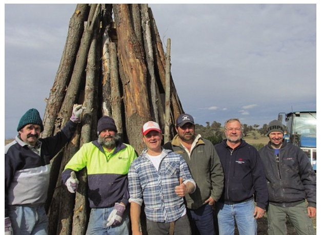
Bonfire is ready! Canberra Swiss Club