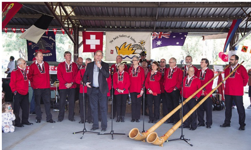
The Swiss Yodlers of Sydney