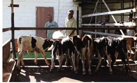
PNG: Dairy farm in Lae

Guinea, located in the country's second biggest city, Lae, offers fresh milk, cream, yoghurt and eggs for sale. Throughout the last fifty years hundreds of bible college students worked on that farm in order to self-support their tuition fees.