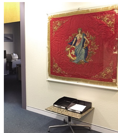
Silk flag made for the Swiss Society of New South Wales. Thanks to Eros Robbiani for the photo of the flag in the Consulate