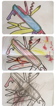
Swiss Play Group Swiss Army knife colouring contest