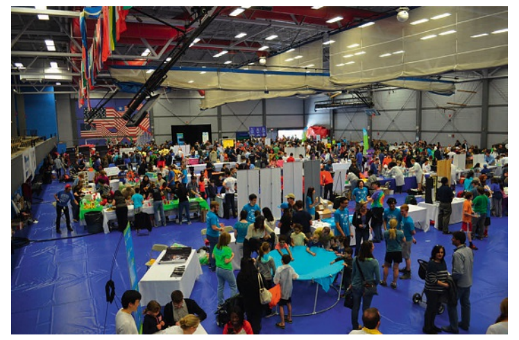
Partial view of the exhibition hall annual Science Festival. As the home of both MIT and Harvard, as well as many other world class research institutions,

Naturally, swissnex Boston – the world's first science consulate – didn't miss out and featured a true highlight at this year's Cambridge Science Festival. Together with University