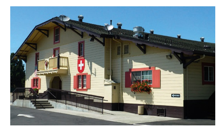
The Clubhouse at the Swiss Park in Newark, California