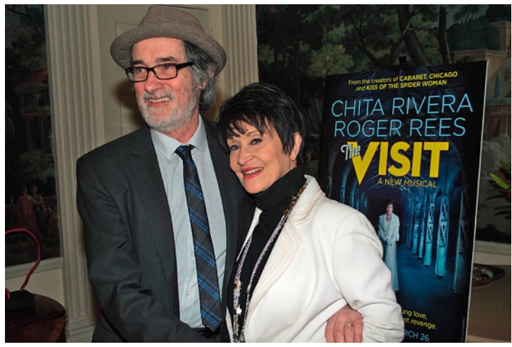
Roger Rees and Chita Rivera, graciously posing for the many photographers