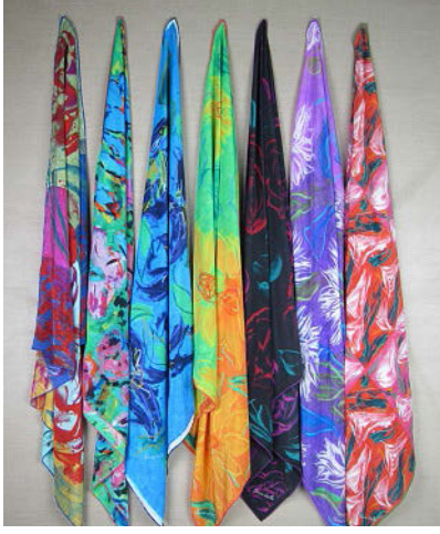
Wearable art: Silk scarves, one for every day of the week!

If not this, then what: Asked what other profession she might enjoy, Galley steps completely out of