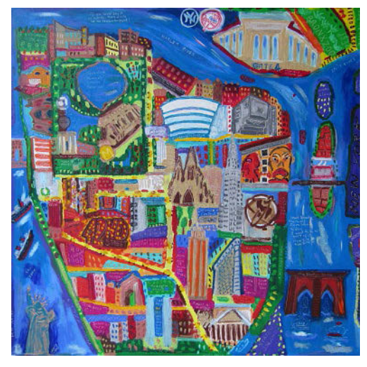
Impressions of New York

from the very beginning. I really have to work at my art and re-visit each project over and over again. That process what creates the passion for me, as [I'm] 'working' a piece.