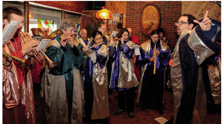
Canadysli in full swing during March 2014 Morgestraich

Our Carnival starts with the Morgestraich on Saturday, February 21 from 6 till 10:30 am, and our Costume Ball is on Saturday, February 28 at 7 pm. Both events will be held at The Musket Restaurant & Banquet Hall, 40 Advance Road, Etobi-