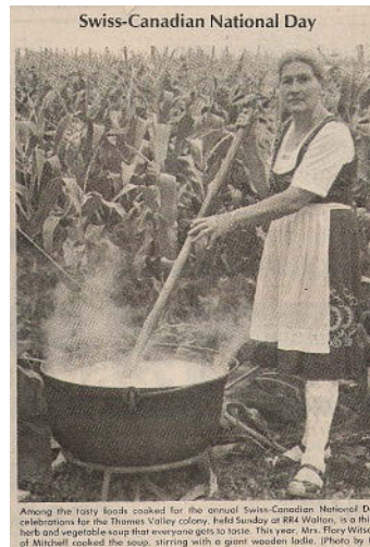
Left: Photo and byline in The Mitchell Advocate , August 3, 1983, of the same year's Thames Valley August celebration Bottom: Thames Valley Club August 2013 Swiss National Day Celebration