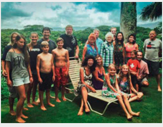
The Swiss Club in Kauai was founded 20 years ago. The members celebrate the 1st of August every year in typical Swiss manner.