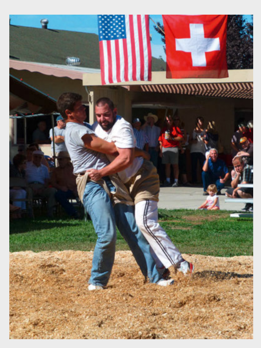
Never too young and never too old for a "Hoselupf"

Schwingfest, San Diego Swiss Club Schwingfest and Aelpler