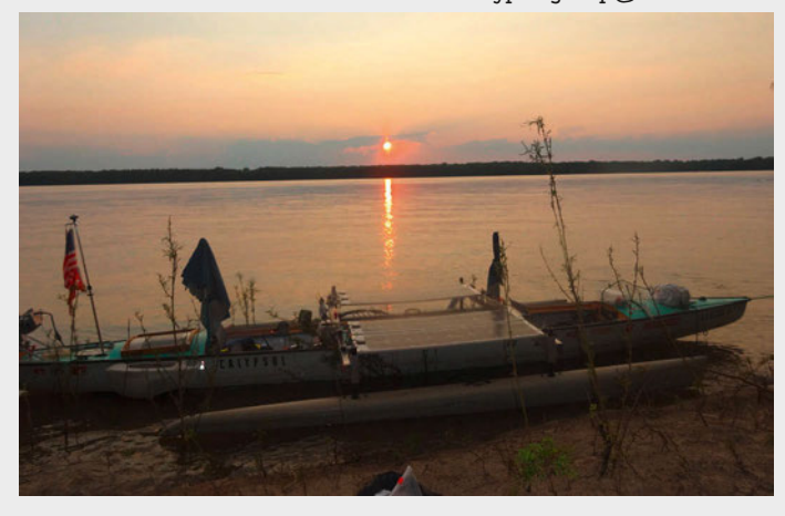
Sunset on the Mississippi, North of Meeman-Shelby Forest State Park, near Memphis, TN