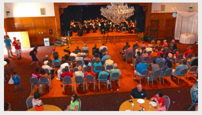
Entertainment was offered in the Matterhorn room and also outside under the large