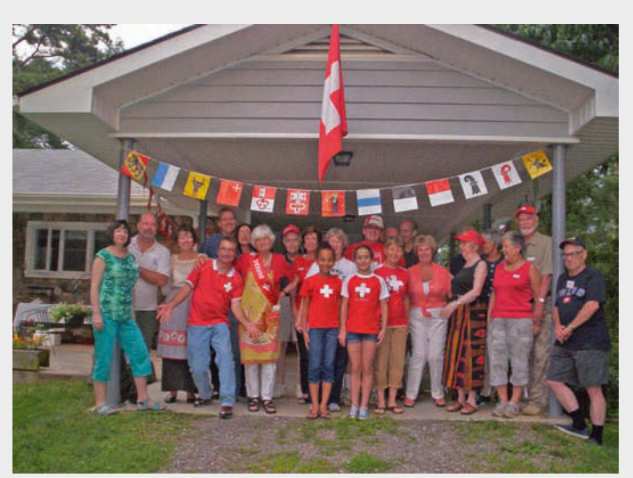
The whole group in front of the Showalter's house