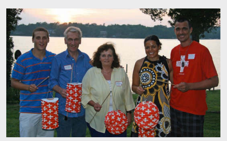
The Boss- and Leuthardt families are ready to enjoy the lampion parade.