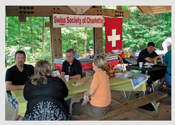
Picnic at Colonel Beatty Park with our German friends

Swiss Society of Charlotte, 10117 Zackery Avenue, Charlotte, NC 28277 Email: Webmaster@swisscharlotte.com Webpage: www.swisscharlotte.com