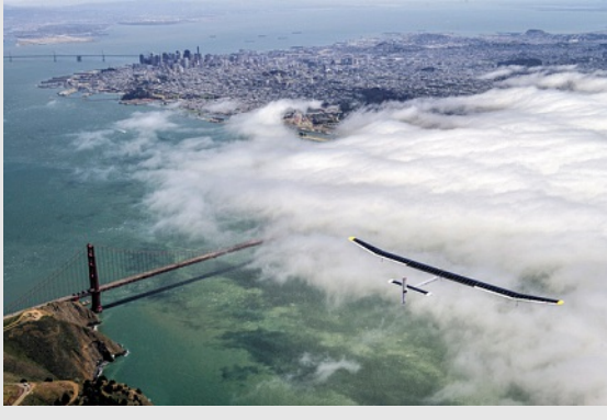
April 24, 2013. Glorious test-flight over the Golden Gate Bridge in San Francisco

Engineers developed the winded fiber design to achieve incredible strength with the lowest