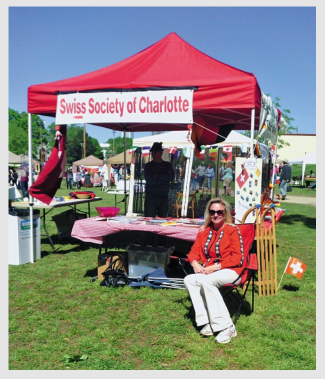
It cannot get more "swissy" than that!

On April 20<sup>th</sup>, 2013, we participated in the second World Parade and Festival, held at Independence Park in Charlotte. It was a sunny and beautiful day and the many visitors enjoyed the multicultural mix with dances and costumes, including various ethnic food stands. A big thank you to our members who volunteered to be at our tent, marched in the parade or spent time talking to people about Switzerland.