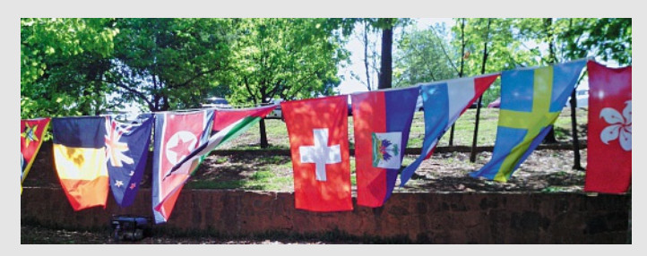
Our Swiss flag, fluttering amongst many others