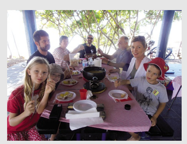
Swiss Fondue at the Beach. Fraser Coast Swiss Group, QLD

phone +41 44 466 9000 fax +41 44 461 9010 www.swiss-moving-service.ch info@swiss-moving-service.ch