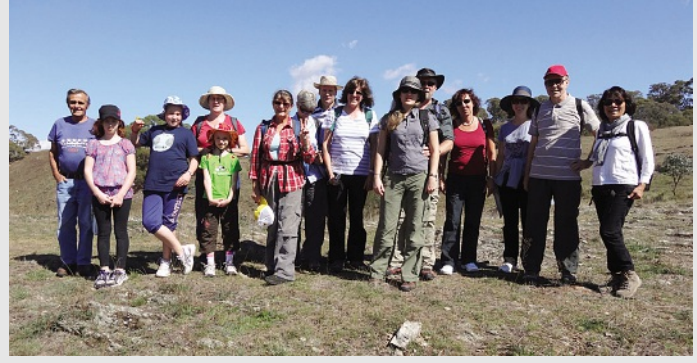
Members of the Canberra Swiss Club before the walk to London bridge at the upper end of Googong dam

22/6 Fondue, North Perth Bolwling Club (please check our website for updates)