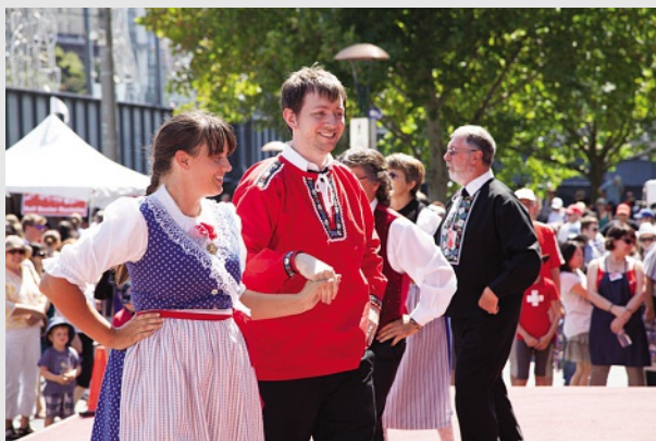
Folk Dance Group Alpenrose @ the Swiss Festival