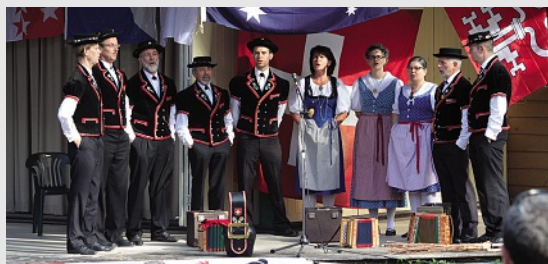
Baerg-Roeseli @ 1.August