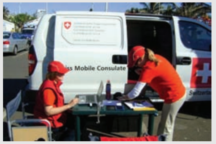
The Swiss Mobile Consulate in action.