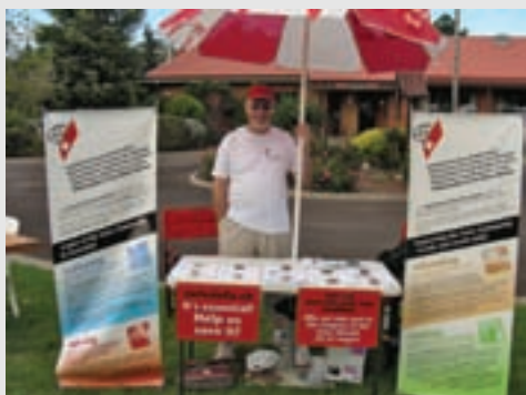
OSA taking part at the Swiss Festival

With the Swiss Yodelling Festival in Interlaken less than one year away, practicing our competition song has become a priority, but we are also keeping up with a good repertoire for other performances, like the recent evening of Swiss songs and music at the Strathdon Nursing Home in Forest Hill, and our traditional participation