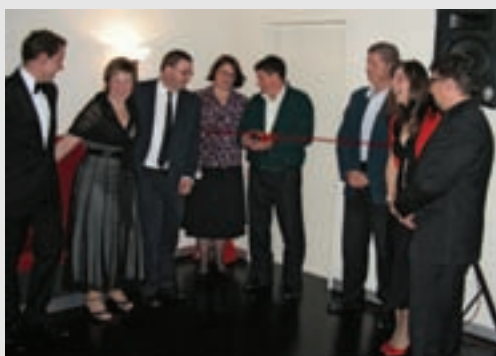
Opening of the second floor, Swiss Club of Victoria