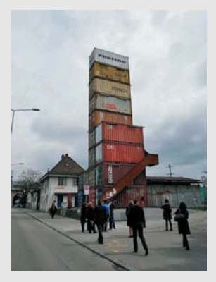
Art and design in Switzerland

bly cooperate. Participant and editor Aaron Britt's impressions of the visits were documented live on the blog of dwell, a leading American architecture and