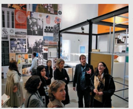
The group visiting a design exhibition

Starting in Zurich, the delegation visited the Museum of De-