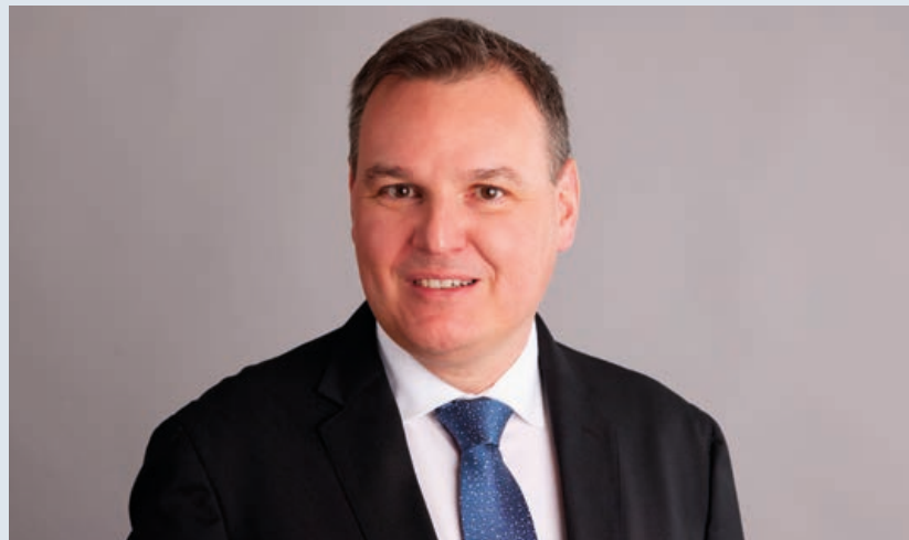
Stéphane Rey, Ambassador of Switzerland to Zimbabwe, Zambia and Malawi.

Previous roles in the Swiss Federal Department of Foreign Affairs included Deputy chief of mission at the Swiss Embassy in Tehran (Iran), head of the political affairs team at the Permanent mission of Switzerland to the United Nations in New York and deputy head of the UN Security Council and political affairs unit in Bern.