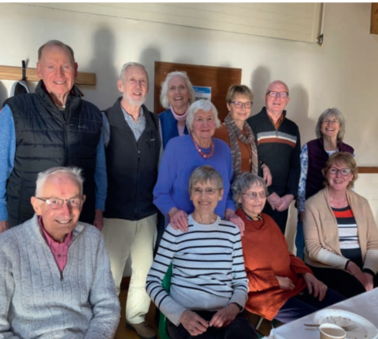
Southern Area Swiss Club met for an informal social afternoon on Saturday 26 th February.