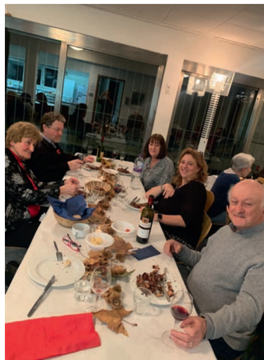
Traditional 'ticinese castagnata' at the Embassy canteen.

The Unione Ticinese's next event will be its Annual General Meeting on 26 March. It will be a hybrid event, which we hope will be combined with a cultural event and a reception.