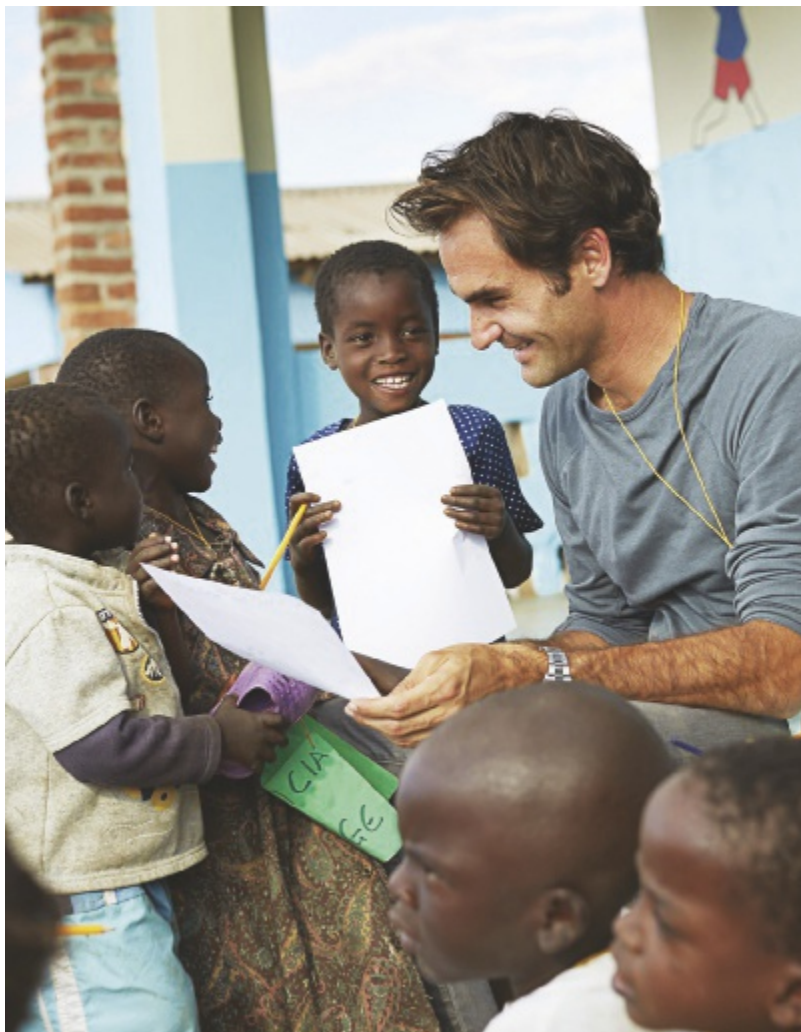
All the proceeds of the Match in Africa go to the Roger Federer Foundation.

proceeds of the Exhibition Night will go to the Roger Federer Foundation.