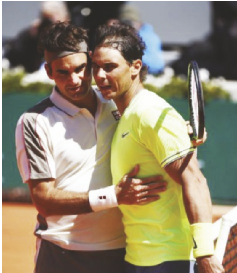
Federer and Nadal to attempt world attendance record in Cape Town.

The Match in Africa is presented by ROLEX, and Credit Suisse is one of the official sponsors. The net