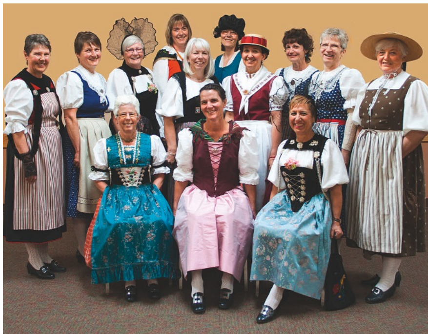
Back row: Murten/Fribourg, Appenzell Ausserrhoden, Bern, Oberengadin/Graubunden, Waadtland, St. Gallen/Toggenburg, Basel. Middle row: Bern, Ober Wallis, Front row: Appenzell Innerrhoden, Glarus, Bern