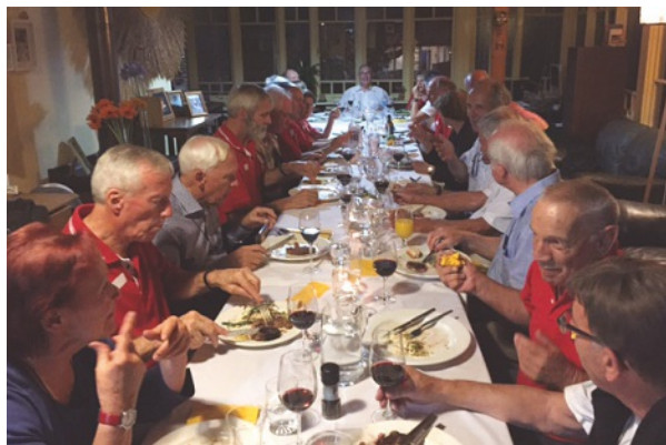
Swiss Yodlers of Sydney: tour party dinner