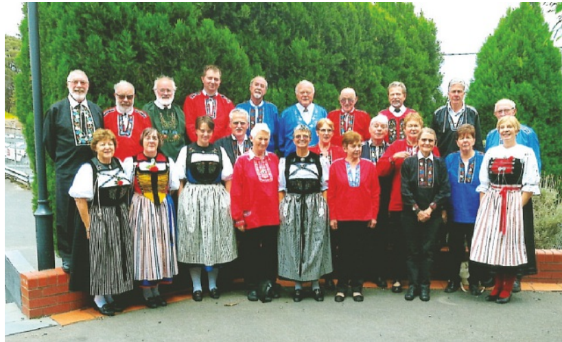
Victoria: Companion Singers and the Swiss Folk Dance group together at the nursing homes

the Companion Singers performed in nursing homes in November as an early Christmas present.