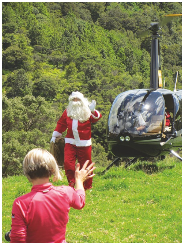
Santa, Auckland style

Monthly Lunch – held on the first Friday of the month. Other venues and details will be published on the Club's website and sent out by email.