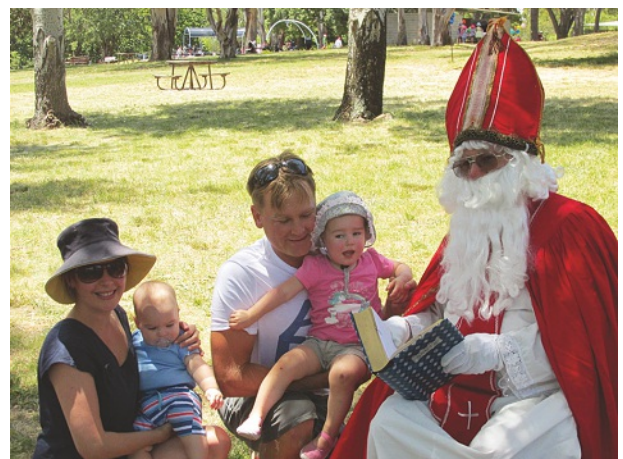
Santa in Canberra

Hopefully you all had a good start into the New Year. Our first event will be a Film night in February. For several years we have been privileged to join the Swiss Jodlers of Sydney on their harbour cruise, so hopefully this year too. Also in February, the Multicultural Festival takes place in Canberra. Usually on Saturday the Swiss and German Radio Programs have a time slot where they broadcast live from the Festival. In March traditionally the Club spends the weekend at the coast.