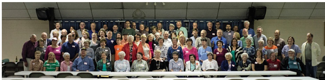
84 persons with Einsiedler roots came to our reunion in Louisville in April 2015

SUSANN BOSSHARD-KÄLIN PR.BOSSHARD@BLUEWIN.CH