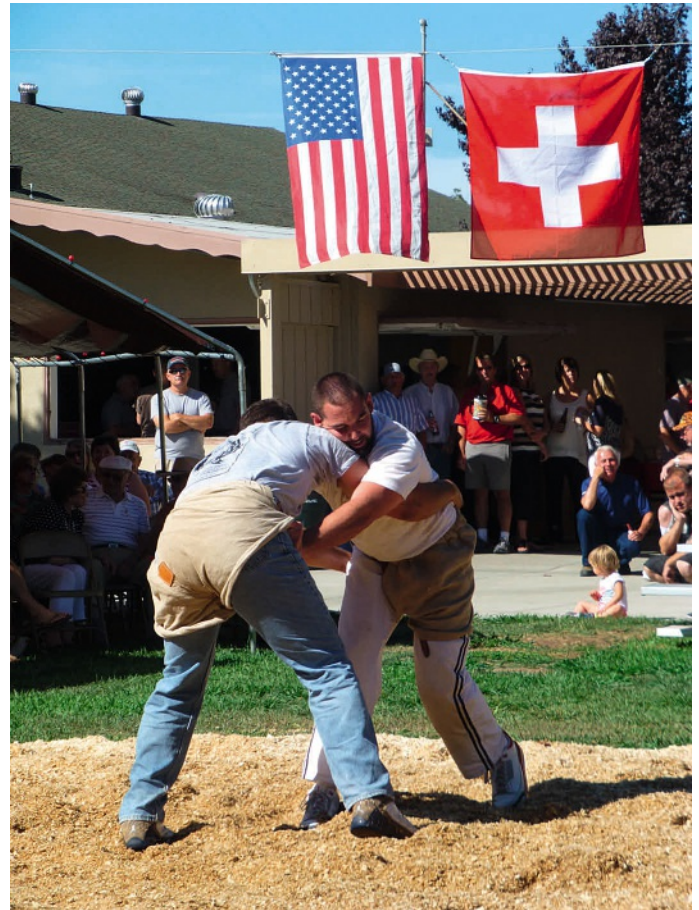
Two Schwingers from the 2014 Swissfest

Schweizer Familie sucht Haus mit Garten bei Basel zum Bewohnen, Pflegen und Verwalten, gerne mit zeitweisem Wohnrecht der Eigentümer und ggf. späterer Kaufoption durch uns. Bei Interesse bitte E-Mail an: rovigno@hotmail.com .