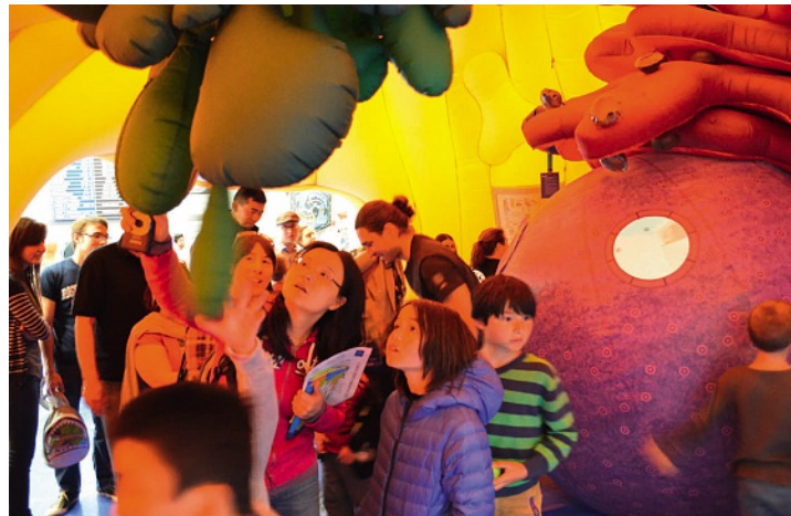
Inside the Giant Human Cell

of Basel, swissnex Boston presented the giant human cell, an inflatable model of a human white blood cell magnified 300'000 times larger than a