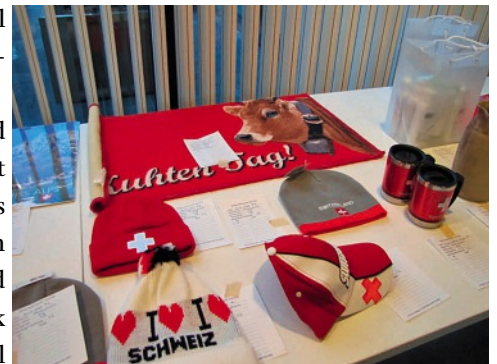
Just a small sample of the many Swiss articles that were placed on sale at the auction