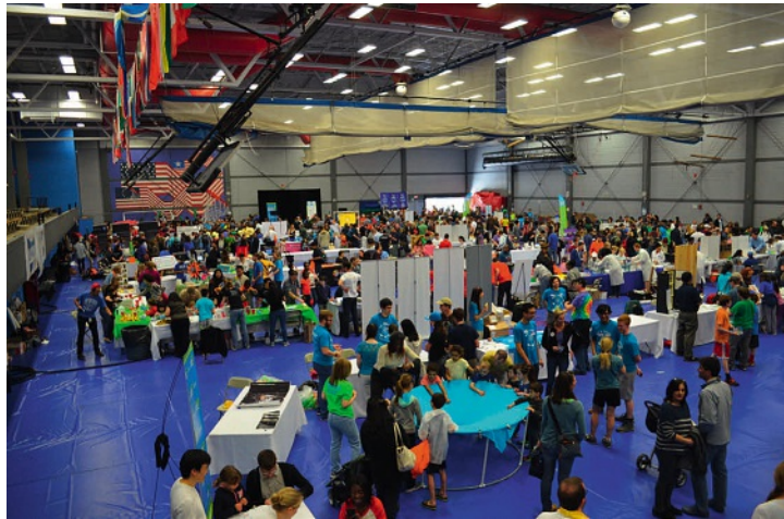
Partial view of the exhibition hall

Naturally, swissnex Boston – the world's first science consulate – didn't miss out and featured a true highlight at this year's Cambridge Science Festival. Together with University