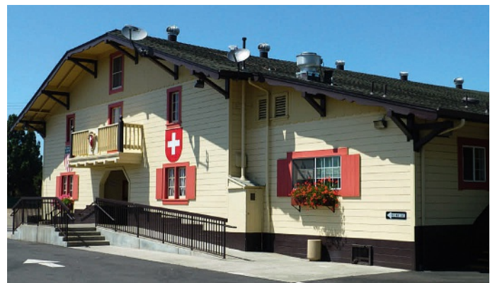
The Clubhouse at the Swiss Park in Newark, California