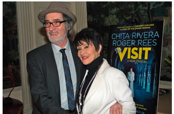
Roger Rees and Chita Rivera, graciously posing for the many photographers