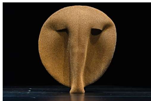
Full Moon? Face? Elephant?