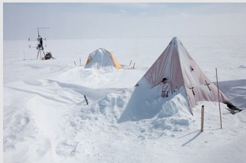
Swiss Camp - the tents only protect from the wind, not the cold, and get snow-covered every night by the wind

Switzerland. Since then, his automated weather stations have continuously been sending data,