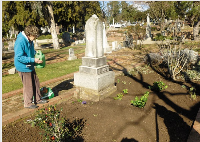
Betty Morant putting the finishing touches on a grave site