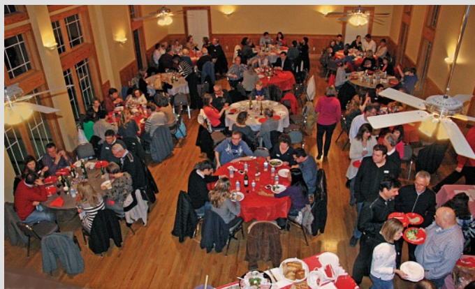
Full house at the raclette party - the evening was a big success and only ended around midnight!