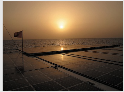
Sunset reflections over the solar panels of the catamaran MS Tûranor PlanetSolar

at such scales before, allow for a better understanding of climate-relevant processes along the trajectory of the Gulf Stream. The MS Tûranor PlanetSolar is an ideal platform for this