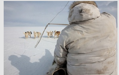
Men and sled dogs - one great team!

Switzerland. Since then, his automated weather stations have continuously been sending data,