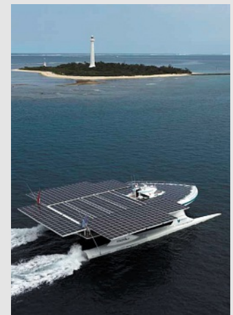
Full Speed ahead!

CONSULATE GENERAL OF SWITZERLAND, ECONOMIC AFFAIRS, COMMUNICATION AND CULTURE, NEW YORK nyc.vertretung@eda.admin.ch