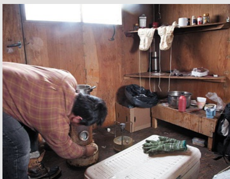
Life in an Inuit village and an Inuit hunting hut