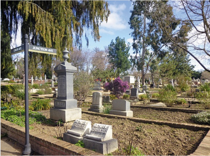
Partial view of the old historic cemetery in Sacramento

The Historic City Cemetery is the oldest existing cemetery in Sacramento. Traversed by pathways and grand avenues, the cemetery provides a park-like setting for exploring history. Today, volunteers with the Adopt A Plot program take over the gardening of plots - a task