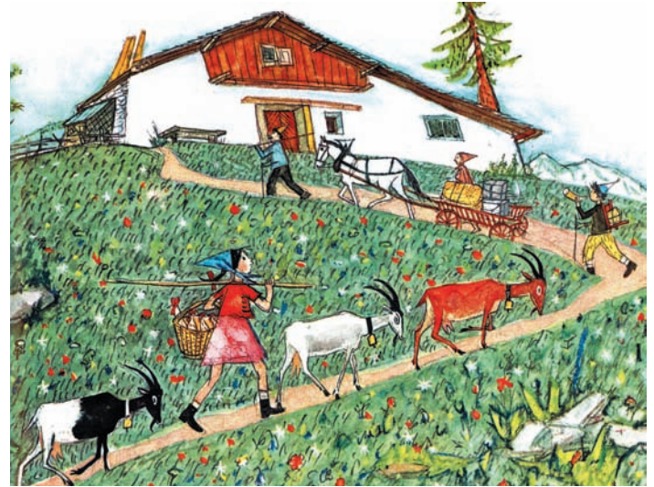
Summer's here at last and Florina, brother Ursli, their parents and their goats set off from their village to stay in their little hut high up in the mountain meadows

There's even an 8km "Ursli" trail that meanders through alpine meadows and along mountain streams. At 20 different points a page of the book is revealed, with the text in Romansch, German and English.