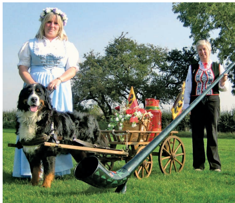
Bernese mountain dog meets alphorn – at Wellington Country Park near Reading

Then they went on their way – just another harmless event that they accepted without any worry at all.