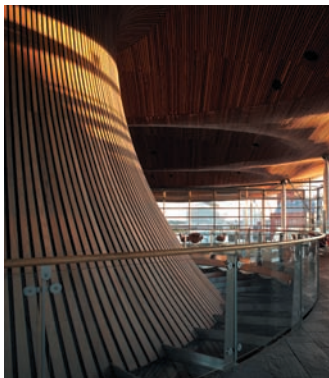
Inside the Senedd, the ultra-modern home of the Welsh Assembly